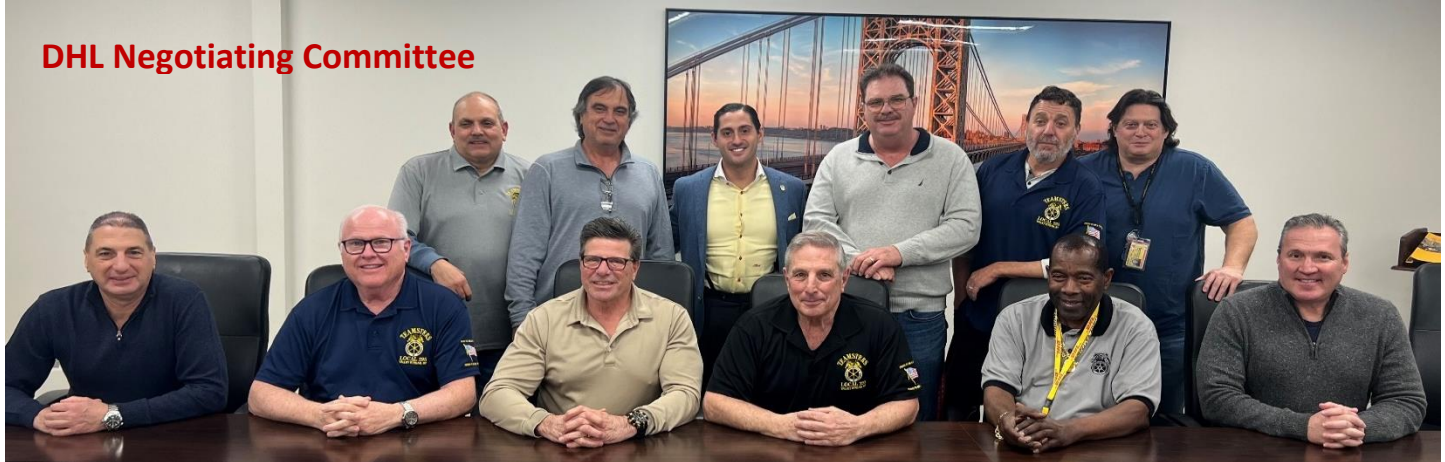
DHL Negotiating Committee