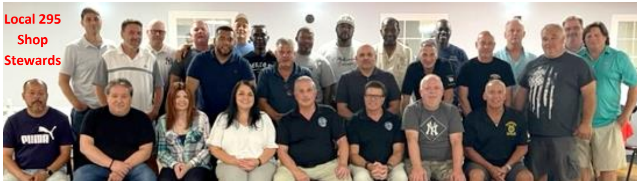
Local 295 Shop Stewards

Our country has moved onward and forward correcting ourselves and improving it for our children and our future. I am a