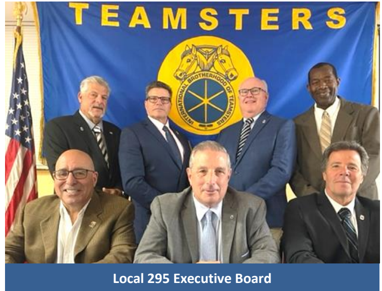
Local 295 Executive Board